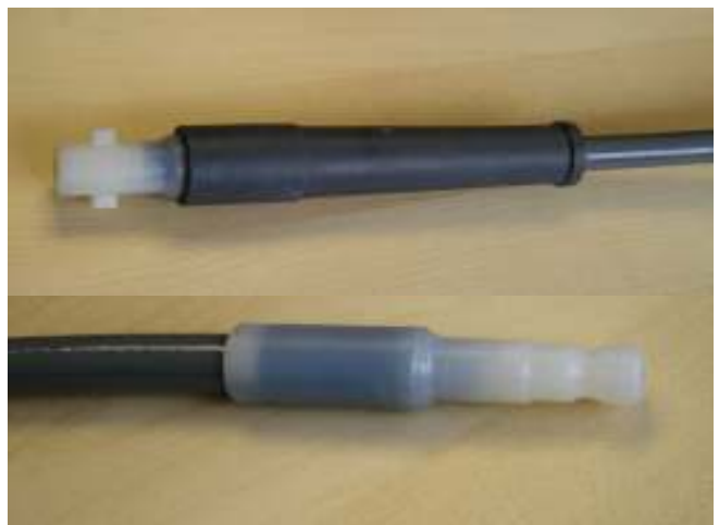
Bespoke application specific casing and interfaces

S S White Industrial is a leader of flexible shafts. The company designs and manufactures its products in UK. S S White Industrial is approved to BS EN 9001, AS9100, aerospace, TS16964, automotive. The flexible shafts are produced in small quantities for industry and large volumes for the automotive sector.